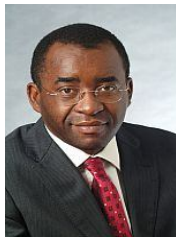
Strive Masiyiwa, Founder and CEO of Econet Wireless Group