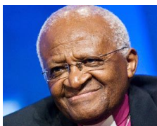
Archbishop Emeritus Desmond Tutu