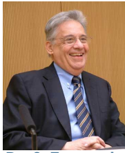
Prof. Fernando Henrique Cardoso, Former President of Brazil